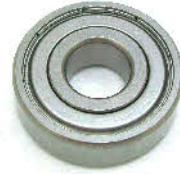
(for illustration only)