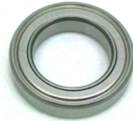
(for illustration only)