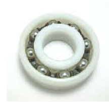
(for illustration only)