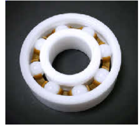
(for illustration only)