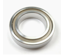
(for illustration only)