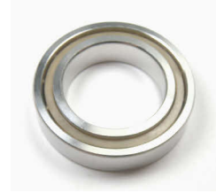
(for illustration only)