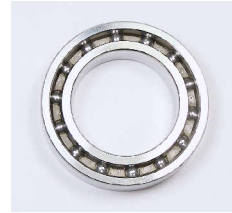
(for illustration only)