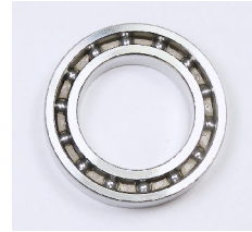
(for illustration only)